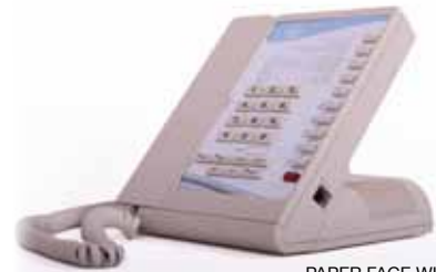
PAPER FACE WITH PLASTIC OVERLAY