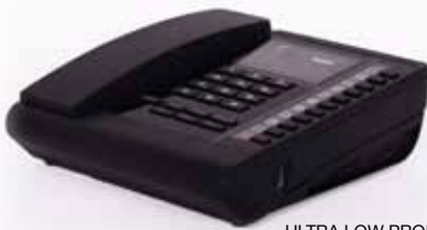
ULTRA LOW PROFILE